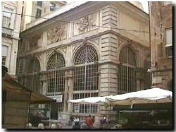
ancient prison ..where Milione”

At the end of Via san Luca you find Piazza Banchi with the beautiful “Loggia”,