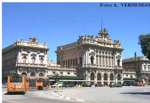
Starting from Genova Brignole Railway Station